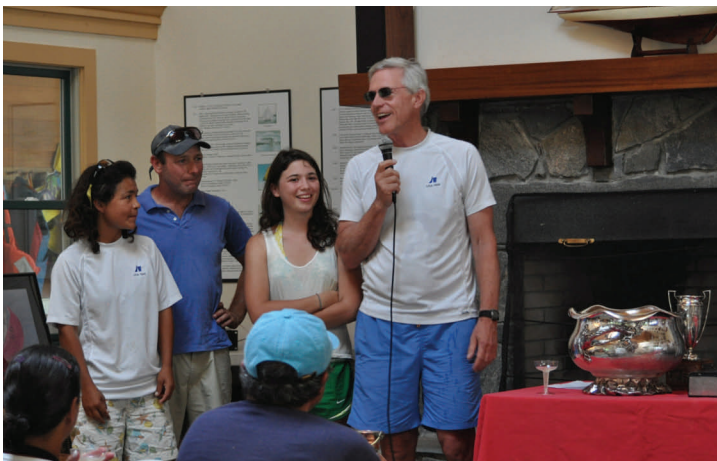
The Winning Skipper and Crew